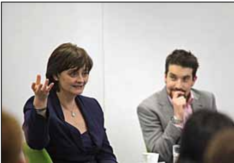
Cherie Booth QC who made an inspiring contribution to the debate