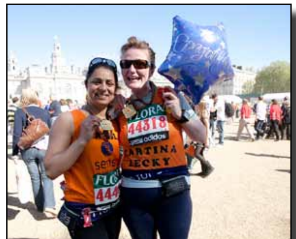
Top photo: At the 7 mile mark Bottom photo: Celebrating their achievement