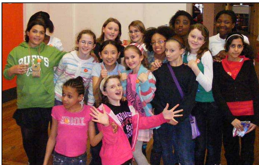
Above & below: Y7 students at the Science Museum sleepover

On Friday 27th March I was one of the 15 Year 7 pupils who went to spend a night at the Science Museum. It was a really fun trip and I made lots of new friends. There were loads of great activities to do including making rockets and watching an IMAX film about Space. There was also a talk where we learnt lots about all the different planets and saw the affect of liquid nitrogen on jelly! In the morning we were taken to the LaunchPad where we experimented with shadow catchers, heat sensors and pressure pumps. Although we didn't get much sleep, it was a great experience and I had an amazing time.