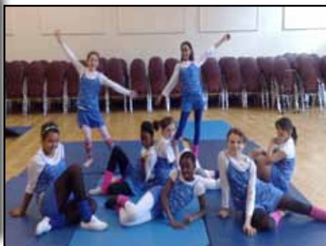
Runners Up: 7C