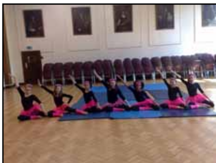
Left - 3rd Place: 7R