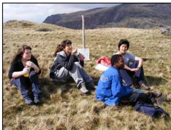
Taking a well earned rest from walking