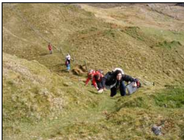
Climbing up those hills