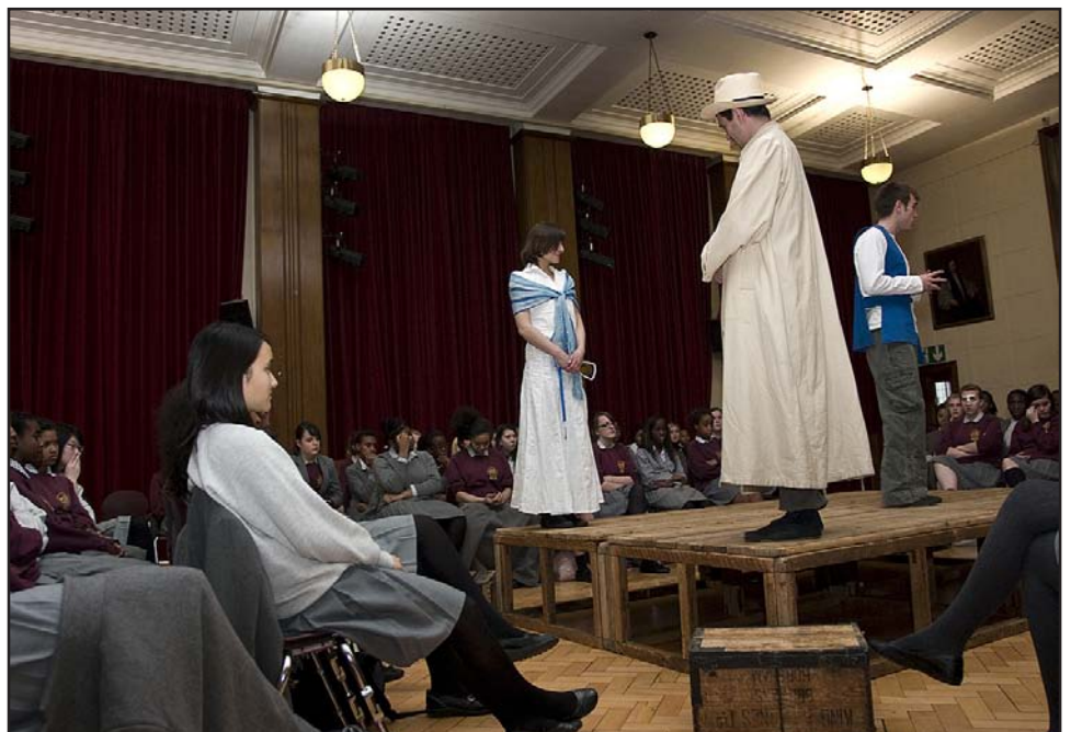
Scenes from the play performed in the Great Hall, St Andrew's