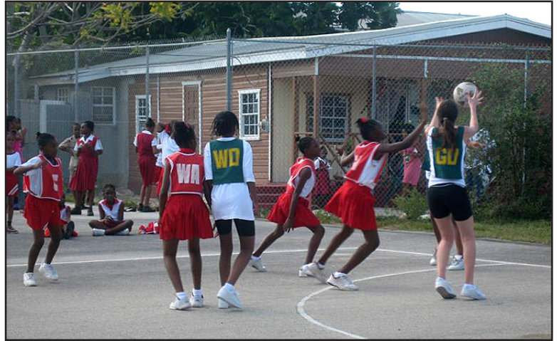
Playing one of our netball games

Day One: What better way to kick start our holiday in Barbados than an island jeep safari. A fantastic way to visit some of the island's top tourist attractions and enjoy our first installment of the sun. This was a great opportunity to photograph some truly amazing sights and explore Barbados. That night we went for dinner at Woodpeckers where we enjoyed our first tastes of Bajan cuisine.