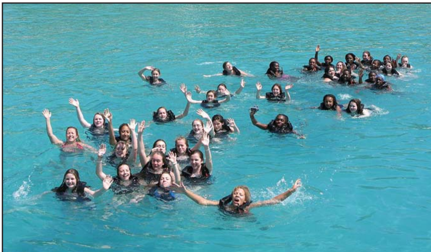
Enjoying the glorious seaside activities

Day two: We set off to The Boatyard where we had three hours of beach access and loads of beach activities. A wide range of activities, volleyball, swimming, trampolines in the water and inflatable climbing walls made it enjoyable for everyone. After lunch we all returned to the hotel to prepare for our first netball game. Our first game was against a primary school St. Mary's. On hearing this we immediately thought 'a primary school, this will be easy!' In fact we were proved wrong when they beat us 22-3!! I guess someone had failed to mention that they were the champions of Barbados and they took netball VERY seriously! Anyway we had to be gracious in our defeat and were all extremely glad that game was over! We made our way back to the hotel to get ready for dinner at a restaurant called 'Jumbie's'.