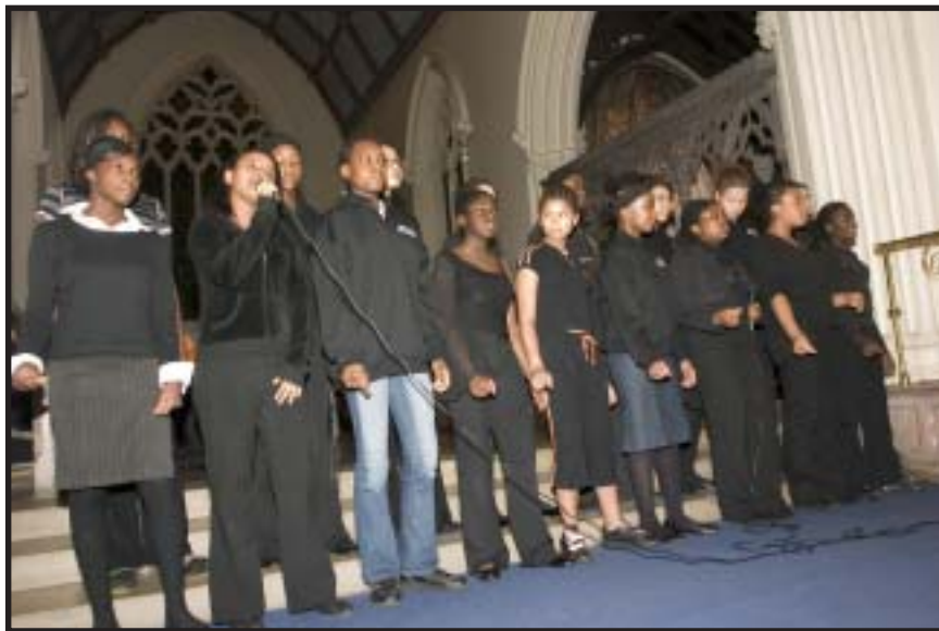
The lower school Gospel Choir

The National Prayer Breakfast is organised by Christian MPs and Peers from Parliament. They hold prayer meetings, a service at St Margaret's Westminster, and seminars each year. Their aim is to build relationships