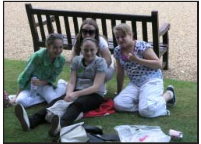
Year 7 students enjoying their trip to Hampton Court