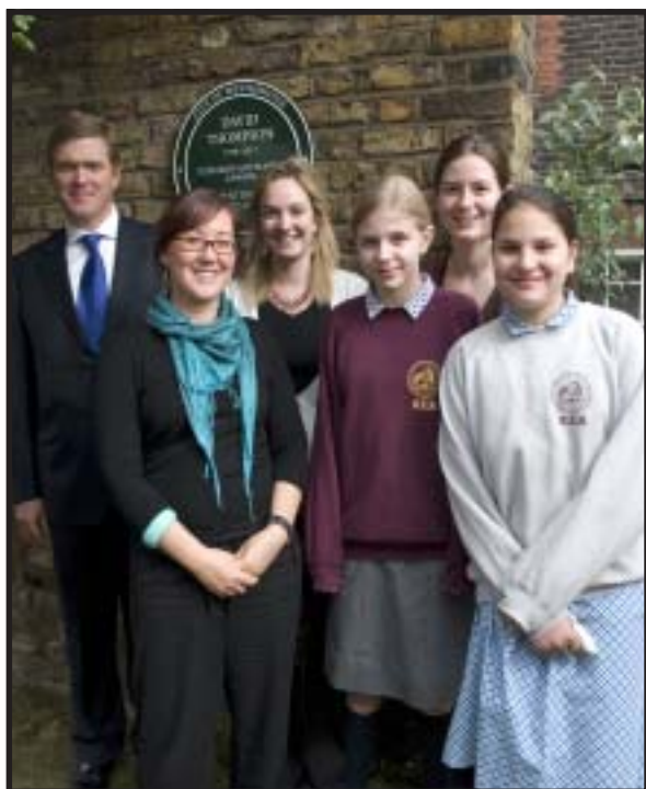
History Tutors & students pose with Ray Mears at the unveiling of the plaque to honour David Thompson

In 1797 he joined the North West Company as Astronomer and Surveyor, to locate and map their trading posts and the waterways connecting them and this assignment he completed over two years. He continued to map and trade furs until the end of the century and eventually he was made partner in that company.