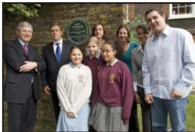
Geography tutors & students pose with Ray Mears and Guy Saint Jacques