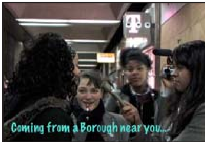
students involved in the film making project

As well as learning the technical procedures such as setting up and using camera and sound equipment for the video shoot the pupils also had the unnerving task of conducting street interviews with members of the general public; this required confidence, patience and perseverance as they soon discovered the difficulties of stopping and engaging busy Londoners who were usually rushing to get home from work. However, the hard work and