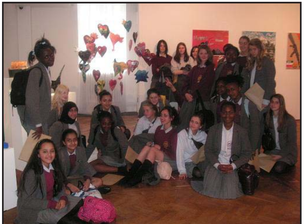
Year 9 Art students at the University of Arts Gallery

Some of the pieces were then selected for the London Institute 'Young at Art' exhibition, open to the public, and the group visited the University of Arts Gallery in central London on 14th May. The work will also feature in this year's Exhibition catalogue.