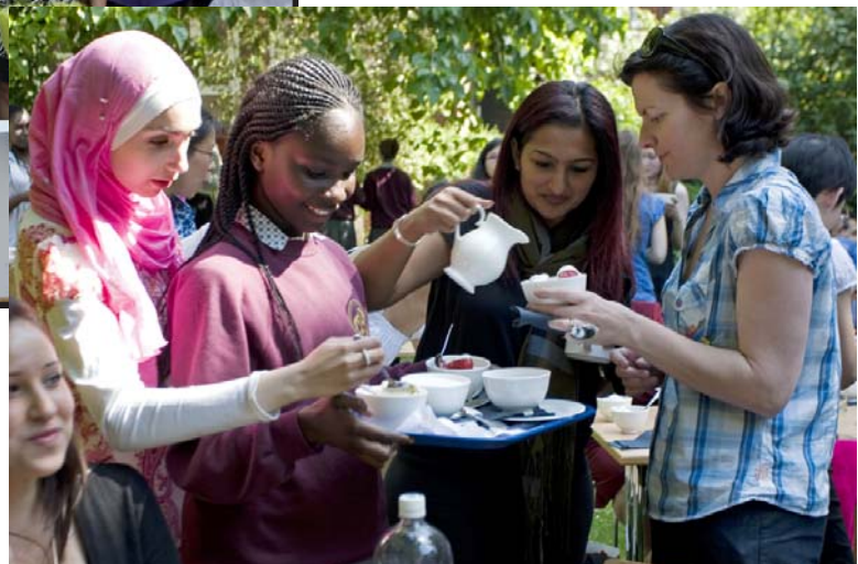
Year 13 students and staff enjoying strawberries and cream in the garden before saying goodbye