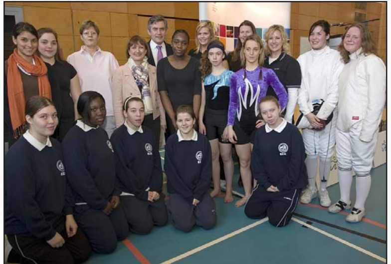
Gordon Brown MP and Tessa Jowell MP photographed with Grey Coat students and staff

Gordon Brown made reference to being a keen sportsman in his school days and said, "this is the most exciting time ever for sport in this country. The range of sports in schools today is amazing". He expressed his belief that by hosting the Olympics, the communities of Britain will pull together in support of our future athletes. Brown finished his speech by saying, "Britain works best when Britain works together".