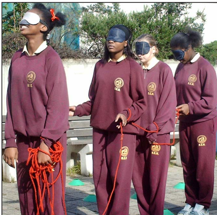
Working as a team on Industry Day

work together as a team and use our heads to get four people in our team across. We had to do press-ups when we got something wrong. Then we did other challenging workshops such as the blind minefield where we had to listen and take orders to get across to the other side safely, and the ladder task where we had to use our leadership and communication skills to be victorious. The hardest task of the day for me was learning to map read but the man who was teaching us made it fun and I eventually got the hang of it. We also played a memory game where the army man told us more about the army and did everything he could to try and make us forget what was under the sheet but we were too good for him. We asked questions that we had about the army and I tried on the uniform.