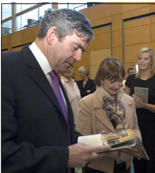
Gordon Brown and Tessa Jowell take a look at the Grey Coat prospectus