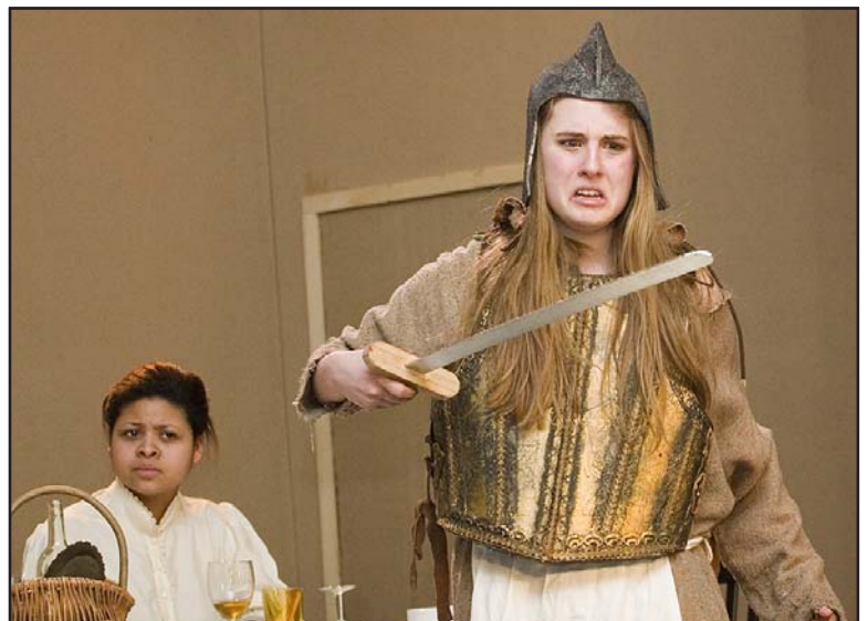
Photos: right - students in scenes from Top Girls