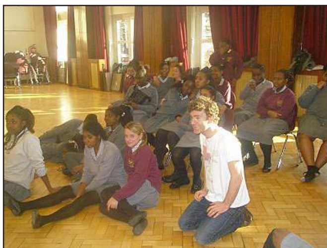
Year 10 students taking part in the drama workshop