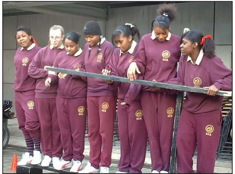
Crossing the mine field on Industry Day

Then several members of the TA and the army came. They had arranged a day full of exciting workshops for us that would hopefully teach us some of these key skills. The first workshop my group did was the one where you had to get your team from one side of a minefield to the other using barrels and two planks of wood. It was harder than we thought it would be but in the end we managed to