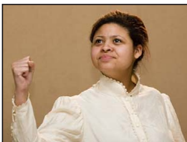
Photos: left - students in scenes from The House of Barnarda Alba