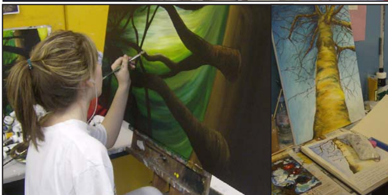
An example of some of the work produced by GCSE Art students