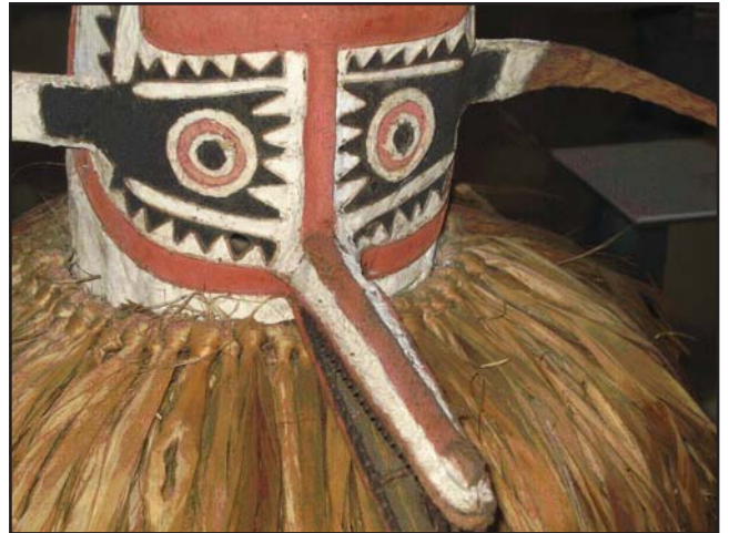
Photo: An example of body adornment, seen at the British Museum

After an hour of drawing and photographing the collection we gathered to discuss what had been most impressive and what we had learnt. All this insight will now go towards the main coursework project in which the Y12 students have to design and make their own piece of modern body adornment to be worn by a model in a fashion show.