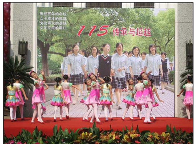
Students perform a dance as part of the celebration