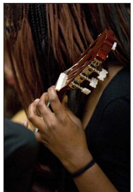
Playing the Spanish Guitar at the concert