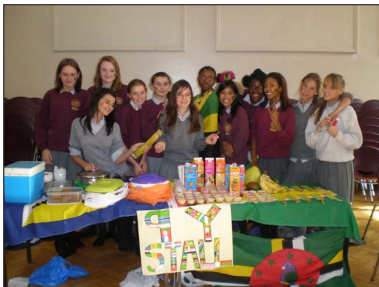
Students from 9Y show off their stand at Black Heritage Day

The drama performance lasted for about an hour and all started with a parking ticket. It was about a young man who was really fed up with England and wanted to explore and know more about his roots and his African ethnicity. He realised and acknowledged all the great people such as Martin Luther King, Harriet Tubman, Nelson Mandela, Rosa Parks and many more who have all done extraordinary things to help the world. All of these people came from an African background which really inspired him. He has a wife and a newly born child and he suddenly gets this ludicrous idea to move his family to Africa and start an internet business. He has a brother from the East London who doesn't care about his ethnicity and background – he was really funny and one of my favourite characters throughout the performance even though he was against his brother's decision. It was by far one of the most hilarious and entertaining drama performances the Grey Coat hospital has ever seen. I definitely took it all in and learnt about famous Africans who fought to make this world a better place for everyone.