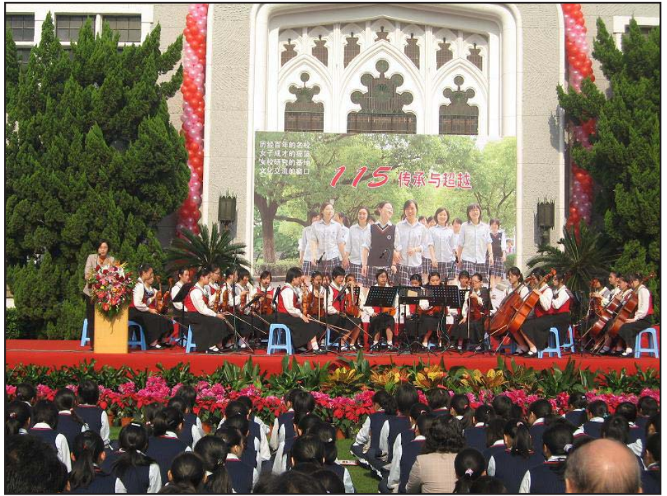
Students waiting to perform musical items in front of local dignitaries. Notice the shape of the windows behind the backdrop. The headteacher is at the lectern.

It was very interesting to meet colleagues from Brisbane, New Zealand, Hong Kong, Singapore, San Francisco, and Japan. We made useful contacts, and learned about what other schools are doing regarding teaching thinking. A number of colleagues also expressed a serious interest in the CASE project, including another visiting headteacher from Shanghai, who gave a response to what he had observed in the seminar after the lesson. We were also keen to find out about how other colleagues teach Mandarin, because, of course the schools all had this as one of the reasons for their link with No 3 High School.