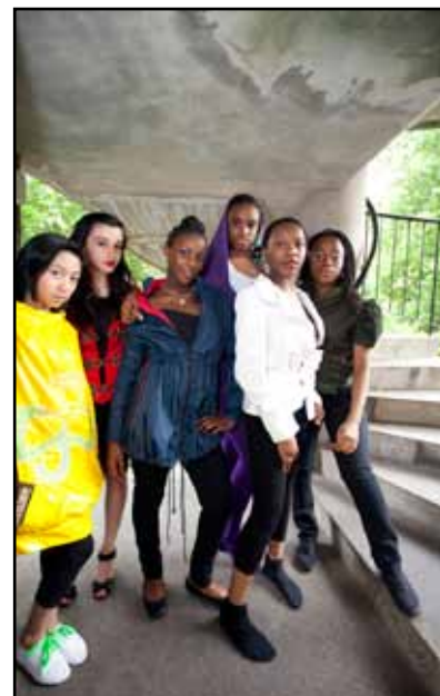
Some of the fashion designs modelled by students