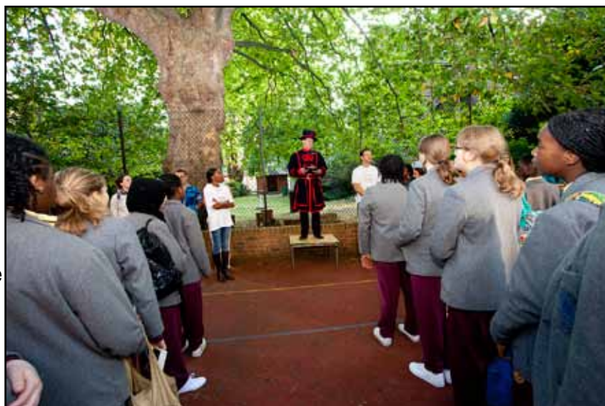
Students watch the Ceremony of the Keys which officially opened 'Freedom Day'

The Yeoman Warders then passed the baskets of keys to the heads of years saying, Keys to the Freedom of GCH for Year 7; Keys to the Freedom of GCH for Year 8; Keys to the Freedom of GCH for Year 9; Keys to the Freedom of GCH for Year 10 Keys to the Freedom of GCH for Year 11