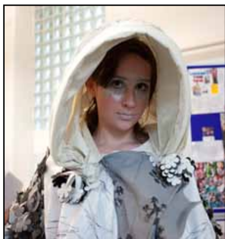
A theatrical cloak