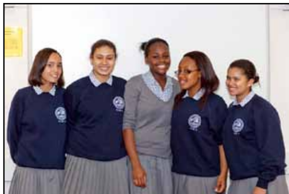
Mathematics students who gave presentations at our recent Y6 Open Days/Evenings

It is quite a few years now since we last asked you for your views on the Newsletter. One of the questions then was whether or not you would like to receive it by email rather than by pupil post, and rather to my surprise, so few opted for email that we did not pursue this option at the time. Since then, the newsletter has been made available on the school website, so that parents are not totally dependent on their daughters remembering to pass the paper copy on. Possibly, this is the best solution, but I would be interested to hear what you think. Perhaps we should be moving towards abolishing the paper copies altogether? Please fill in the questionnaire and send it back to the school, so that we can get as full a picture as possible of what you would prefer.