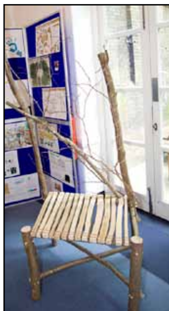
A natural wood garden chair