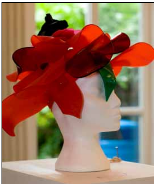
Above: One of the hats on display at the exhibition