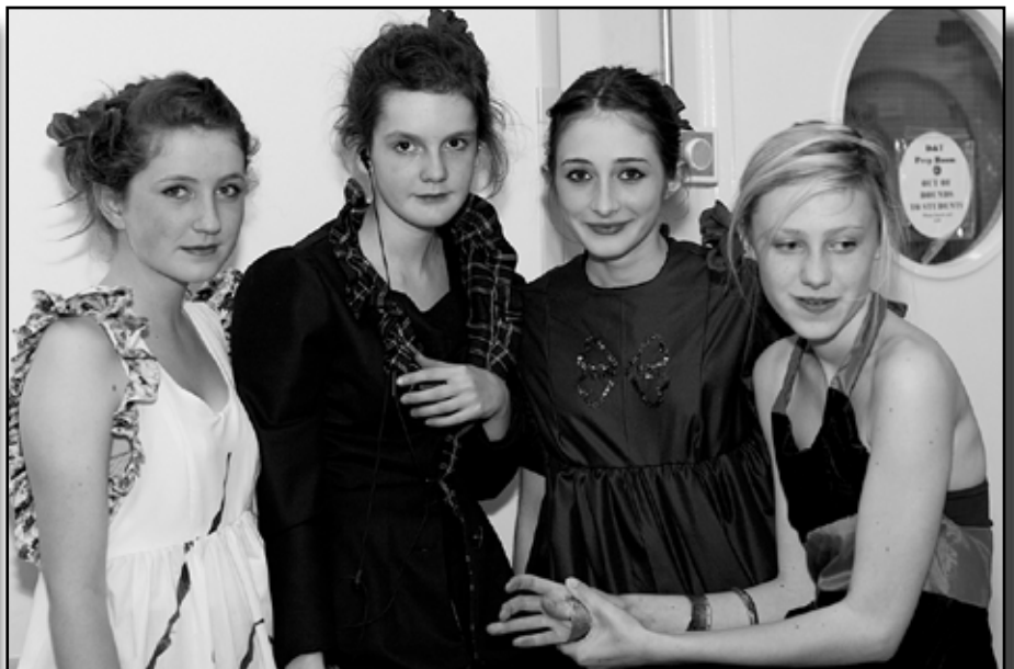
Lower school students model some of the beautiful work produced by Y11 textiles students for this year's annual NRA Day fashion show