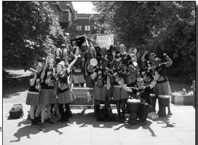
Music students busking for Cancer Research

On Wednesday 24th June, musicians from every year group gave up their lunch break to raise money for Cancer Research. As part of the national Busking Cancer event, the musicians entertained staff and students at lower school by busking in the playground (luckily, it was a sunny day). Over £300 was raised and thank you to all those who performed or gave generously.