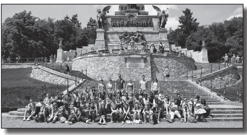
Year 7 students in Rüdesheim, Germany