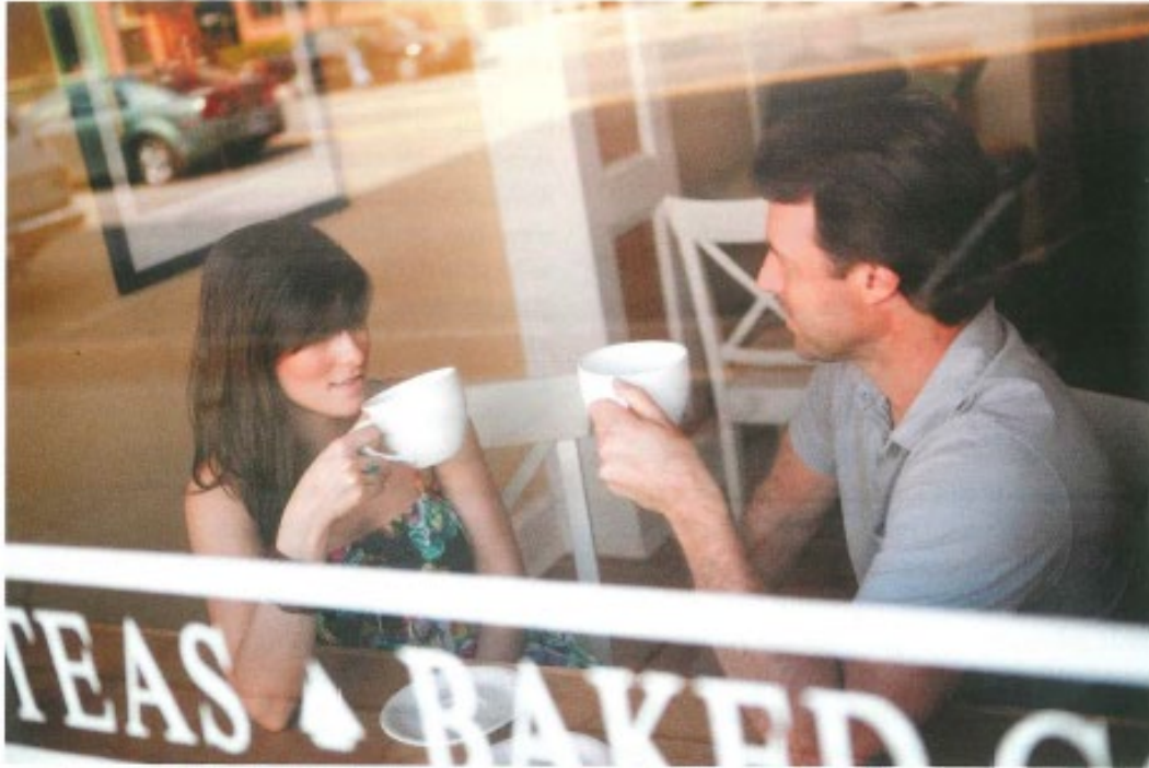
Meeting friends for coffee is part of a social ritual which also situates people within their broader social context.

coffee is a socially acceptable drug, whereas cocaine and heroin, for example, are not. Yet some societies tolerate the consumption of cocaine but frown on both coffee and alcohol. Sociologists are interested in why these differences exist and how they came about.