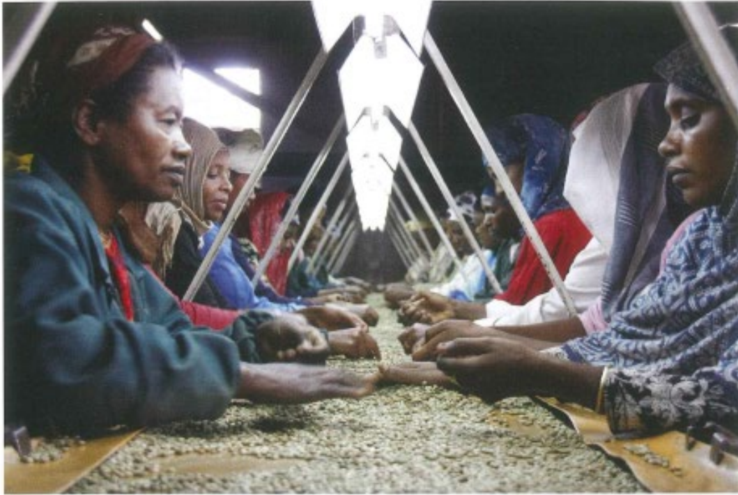
Coffee is more than a pleasant drink for these workers, whose livelihoods depend on the coffee plant.

pay the full market price to small producers in developing countries. Others patronize 'independent' coffee houses rather than 'corporate' chains such as Starbucks and Costa.